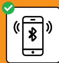
To break infection chains: download and activate the SwissCovid app.