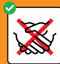
Do not shake hands.