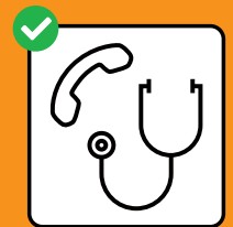
Only visit a doctor's office or an accident and emergency department after making an appointment by phone.