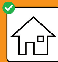
If you test positive: isolate. If you have had contact with a confirmed case: quarantine.