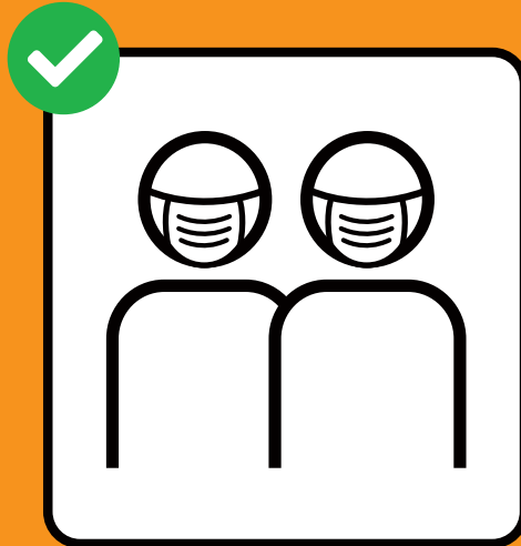
Wear a face mask if it is impossible to maintain that distance.