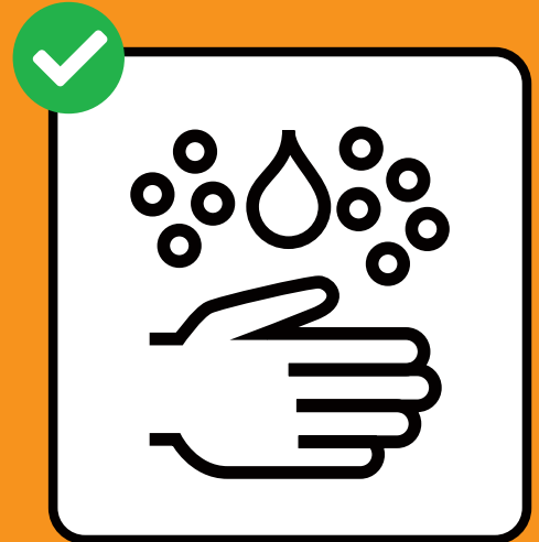
Wash your hands thoroughly.