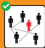
To enable contact tracing, always provide your complete contact information.